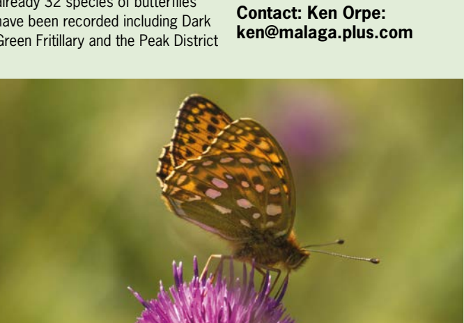
Dark Green Fritillary

Car Parking This will be at Curzon Lodge (DE4 4HN) which is situated down the hill towards Grangemill from the crossroads in Longcliffe village. Mini buses will then take visitors direct into Hoe Grange Ouarry.