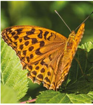
Silver-washed Fritillary